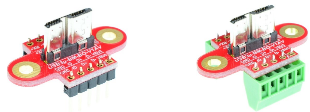
Figure 3: USB3u-BM-BO-V1AV Various connections